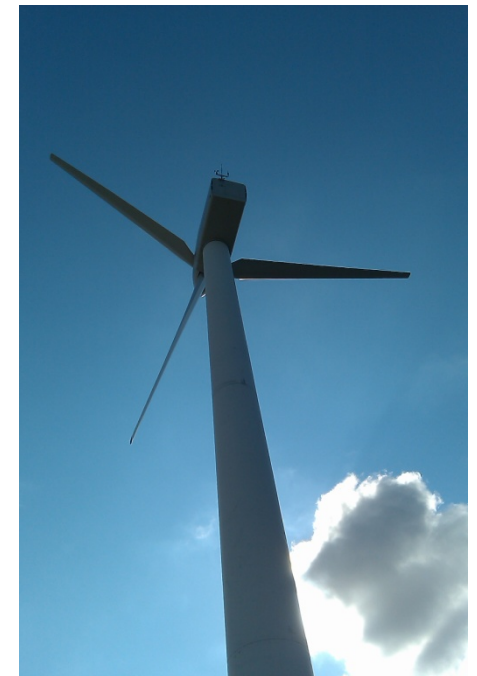
Vestas V27 225kW WT located at Sopko site