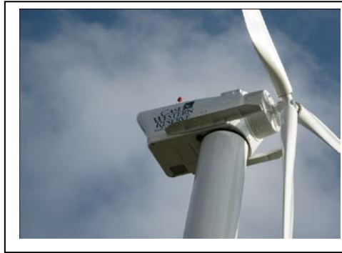
NorthWind 100kW WT located on the CWRU campus

For Industry Partners and Researchers that are interested in demonstrating products on the wind turbines please contact our Faculty Director, for more information.