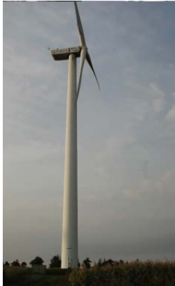
Nordex N54 1.0MW WT located at Sopko site